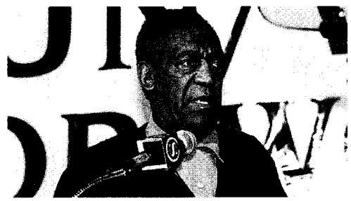
Bill Cosby will host the event.

Cancer Care is pleased to be named one of the beneficiary charities of New York's First Annual REVLON Run/Walk for Women, organized for the fight against women's cancers. The event will be hosted by entertainment great Bill Cosby and REVLON spokespeople Cindy Crawford and Halle Berry, and will take place on Saturday, May 2nd.